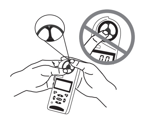
I Figure 1

Orient one "arm" of the module straight up. [Is Figure 2]. The impeller can be pushed in from either side.